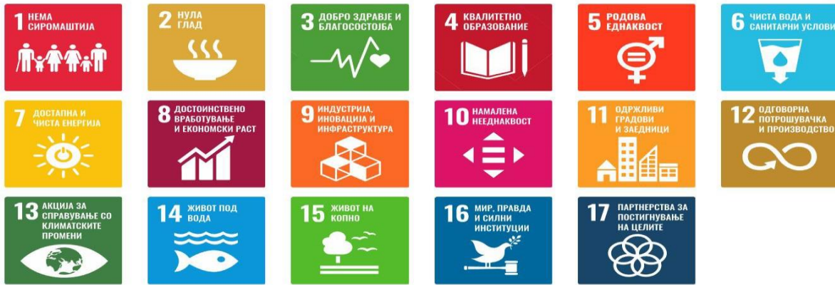
Figure 2. Agenda for Sustainable Development until 2030

For sustainable agricultural production and sustainable development in all spheres of social life and functioning, adequate management, that is, adequate organization and management, is necessary. In particular, sustainable agricultural production includes: soil management, water and irrigation management, erosion management, available energy management, pasture management, etc., which is graphically presented in Figure 3.