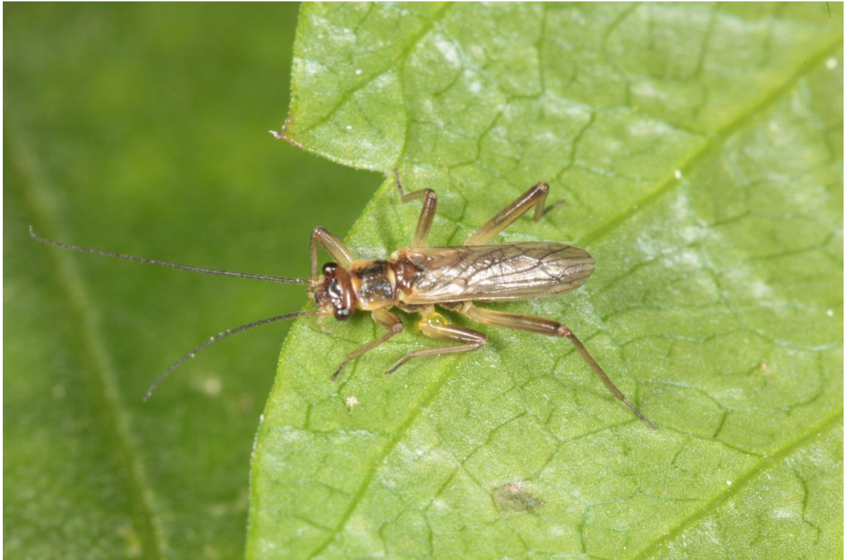
Nemoura uncinata Despax, 1934

Material examined: NORTH MACEDONIA, Shar Planina: Popova Šapka. 5.5.2024. 1♂;